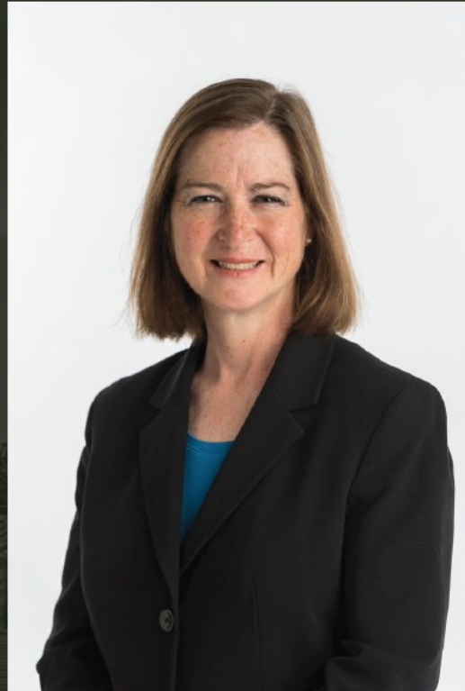
Barbara McQuade Former US Attorney, NBC/MSNBC Legal Analyst, and Author

Fairhope United Methodist Christian Life Fellowship Hall 155 S Section Street Fairhope